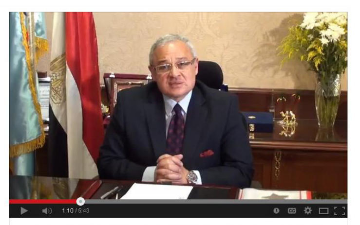
Message from The Minister of Tourism of Egypt (August 22, 2013)

But governments, too, along with local and foreign initiatives are penetrating the social media. The Egypt Tourism Authority website (www.Egypt.travel) promots Egypt as a travel destination. The messages conveyed show that