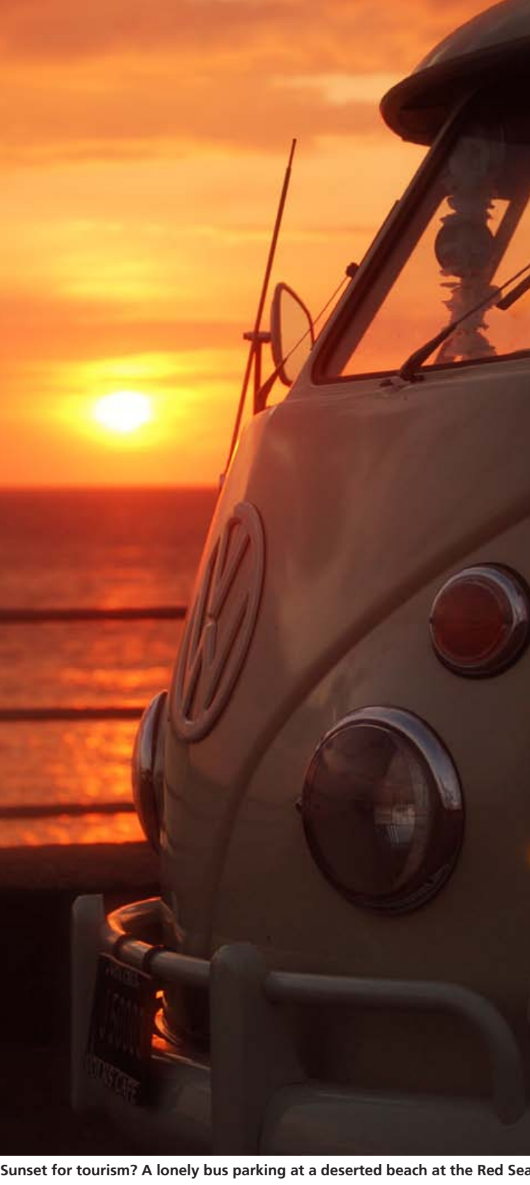
Sunset for tourism? A lonely bus parking at a deserted beach at the Red Sea