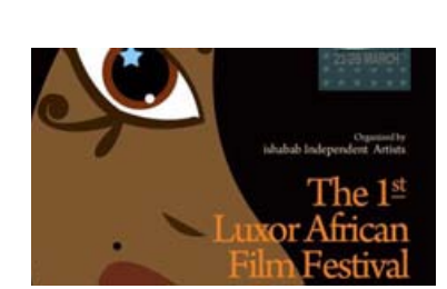
Luxor hosting African films