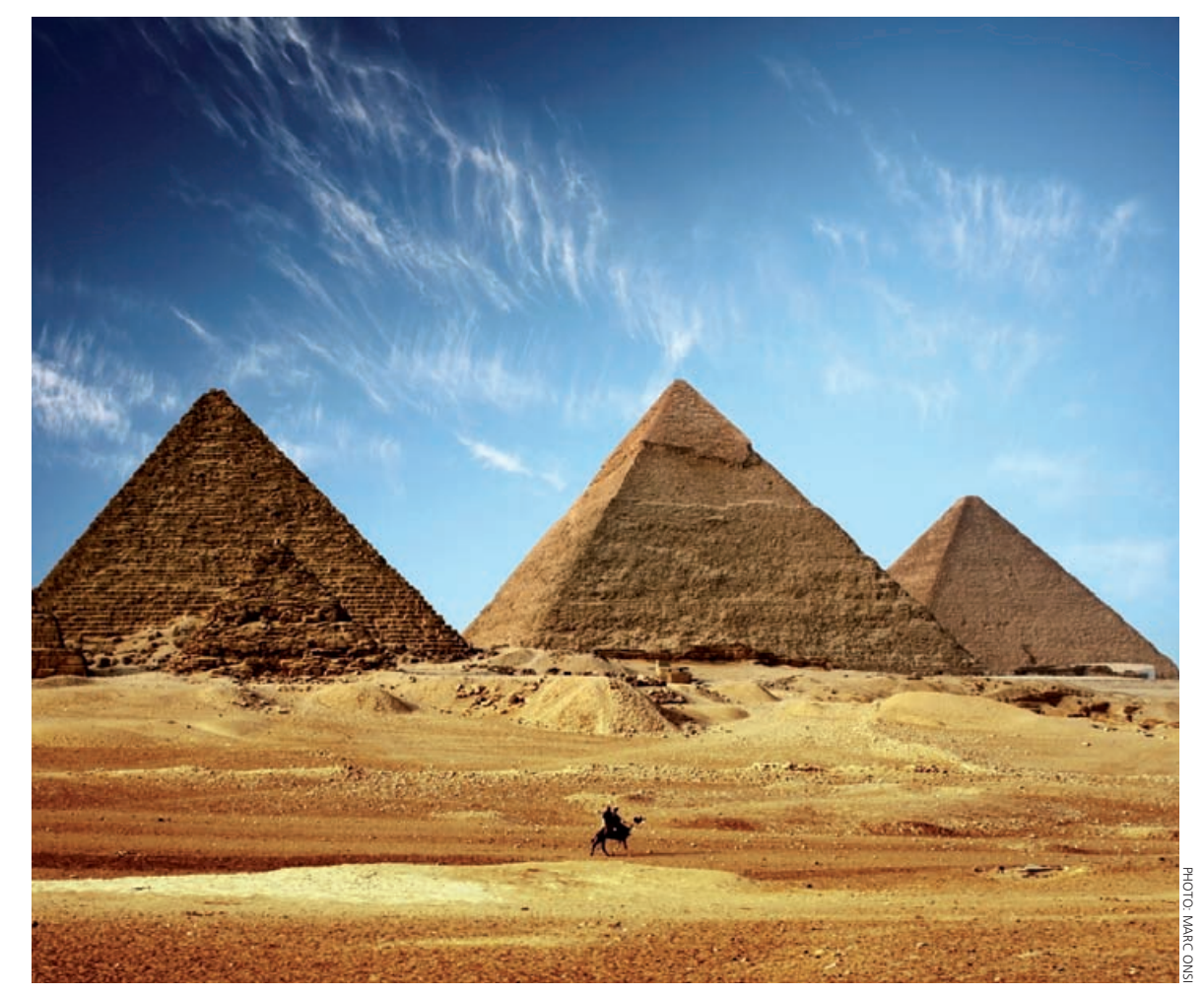
Tranquillity at the great pyramids in Giza, for once: Tourists visits have dropped from 50.000 a day to about 15.000 in late 2013 - giving the ancient site some space to breathe and recover its magic charme