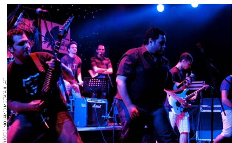
Musicians at the Cairo Jazz Festival: Will it rock tourists numbers?

Cairo International Jazz Festivai also hosts a number of side events such as workshops, master classes, film screening, and kids programs. Cairo International Jazz Festival was founded in March 2009. The